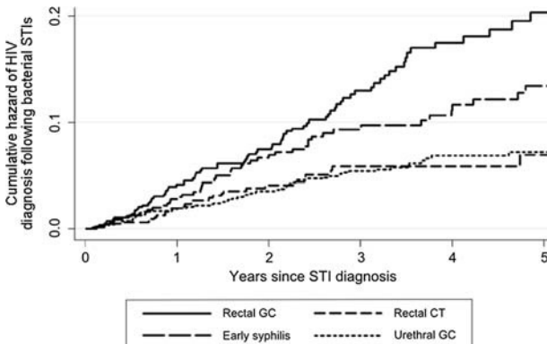
FIGURE 1. Cumulative hazard of HIV diagnosis following bacterial STIs (STI) GC = gonorrhea, CT = chlamydial infection.

The relationship between HIV and STI acquisition is complex and multidirectional. Some evidence suggests that genital tract inflammation caused by bacterial STIs increases the risk of HIV transmission by increasing HIV shedding by HIV-infected partners and causing breaches in the genital tract epithelium and recruitment of target cells to this area in HIV-susceptible partners. 2–12 However, these biological mechanisms require the pathogen to be present at the time of HIV exposure. Rather, our findings are likely a result of the association between different STI and subsequent behaviors and sexual network factors that result in exposure to HIV. Rectal infections are direct markers of condomless receptive anal sex, which is associated with a greater risk of HIV acquisition than oral or insertive anal sex, 26–28 and because the syphilis epidemic in the United States and other developed countries is concentrated among MSM living with HIV, 29 early syphilis may be a marker of condomless sex within sexual networks including high-risk MSM living with HIV. It is also possible that men at higher risk for acquiring HIV are more likely to seek STI screening in general, in clinical settings where extragenital testing is available, or are more likely to recognize or seek care in response to symptoms. Exploring the reasons that STI diagnoses predict future HIV acquisition may help identify additional targets for prevention interventions.